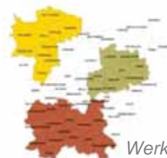
Werkingsgebied regionale landschappen